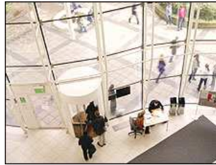
University is now a consumer experience, suggests a survey